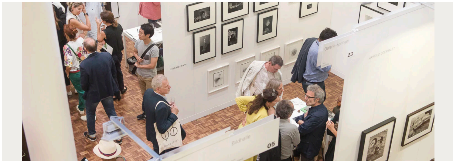
Photo Basel takes place from 16 to 21 June 2026 as Switzerland's first and only international art fair dedicated to photography-based art. Located in Basel during one of the most important weeks in the art calendar, the fair offers a focused view of contemporary and modern photographic practices. Its position within Basel's art week makes it a valuable destination for collectors interested in photography, image culture, and the expanding role of lens-based media within the contemporary art market.